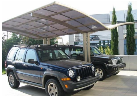
Double-Sided Cantilever Carport